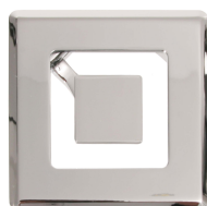
ORBIT 80 Q