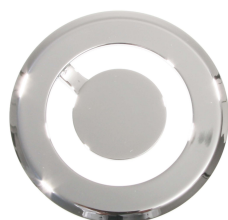
ORBIT 80 K